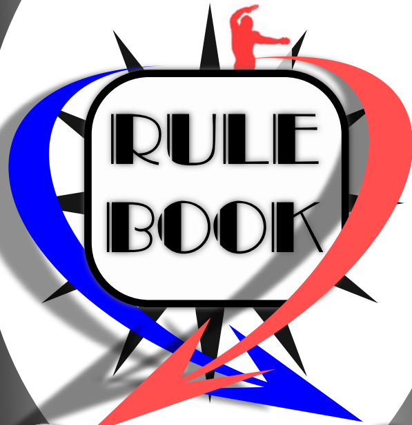
TABLE TENNIS LEAGUE