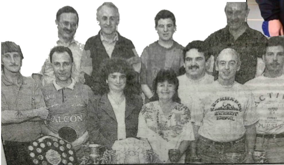
● An anniversary to remember... members of Birkenhead Civic Club celebrated 20 years' membership of the Wirral Table Tennis League with their best-ever performance — they won every division in which they had a team as well as three major cup competitions.