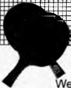
TABLE DIGEST TENNIS