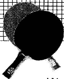
TABLE DIGEST TENNIS